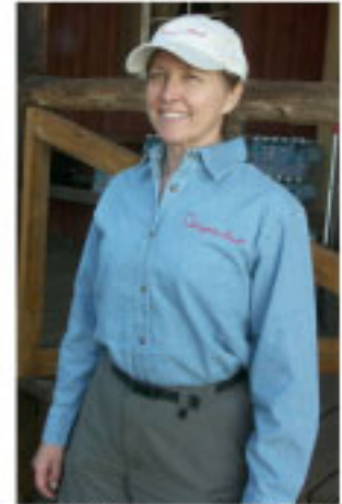
Ball Cap $13.00 Ladies Denim Shirt $25.00