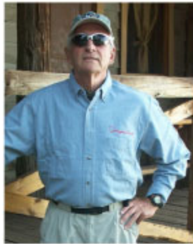
Men's Denim Shirt $25.00