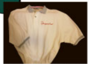
Polo Shirt $20.00

Or order online with a credit card www.aztrail.org