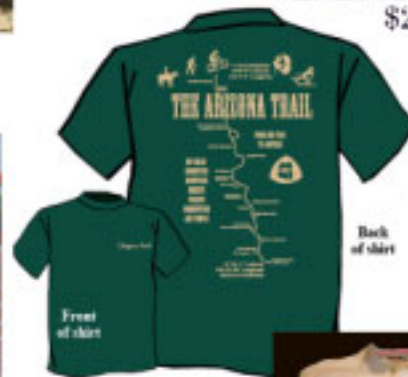
Waypoints T-Shirt $13.00