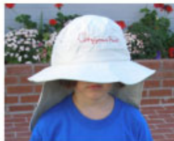
Sonoran Sunbuster Hat $20.00