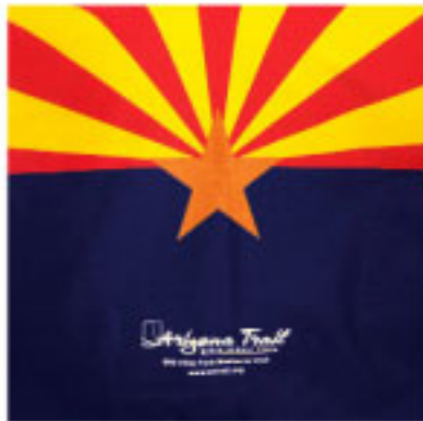
Bandana $5.00 FREE with any order

Polo shirt – Was $30 , now $20 while supplies last. Denim Arizona Trail Shirt Regularly $30, Sale Price $25. All T-shirts (Resupply and Waypoints) – Sale Price $13 And with each order, receive a FREE bandana!!