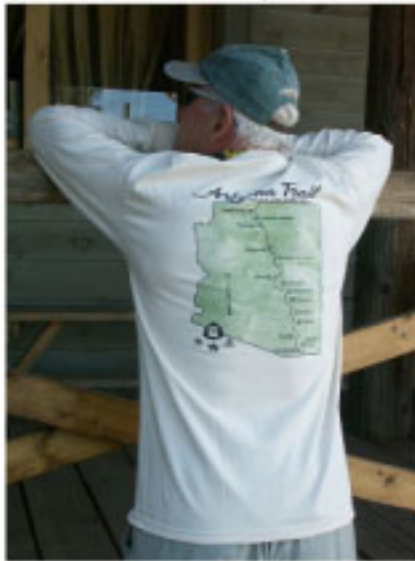
Resupply T-Shirt $13.00