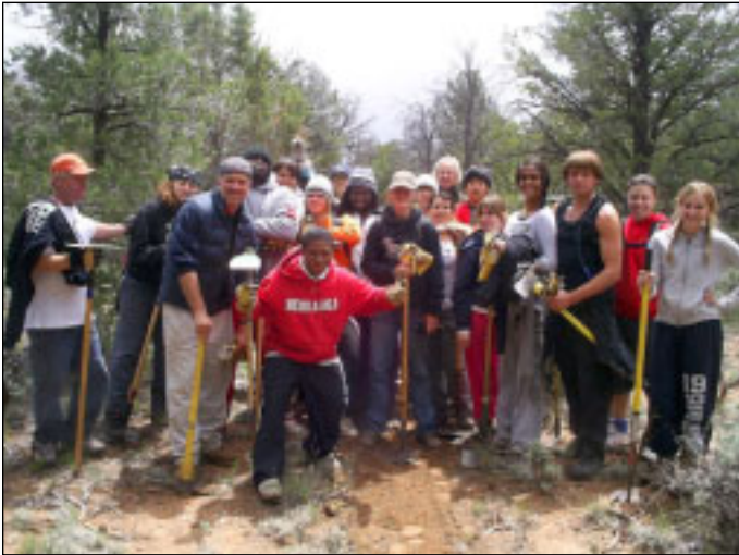
Students and teachers from Orme School celebrate 2 miles of tread rehab at the annual Memorial Day event near Orderville Trailhead.

Big round of applause to the crew from Orme School who braved the stinging snow pellets and wind to re-hab two miles of Segment 42 north of Government Reservoir! The segment was one of the original sections of the Arizona Trail back in the late 80's/early 90's, and had never been maintained until now. This was a big adventure for some of these students from all over the globe, and they did a great job.