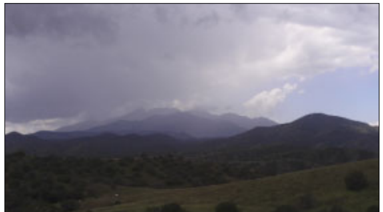
August 2006 storm coming in on the east slope of the Santa Ritas, looking SW from Oak Tree Canyon.

P.S. There is treatable water available up the Honeymoon Trail from the Winter Road Trailhead. Contact me, Mike Carr, for directions if needed.